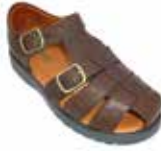
Sandal Falcon 8 - 1½ E