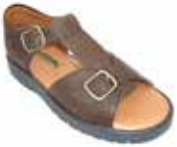
Sandal Faze 8 - 1½ E