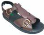
Sandal Bump 12 - 6 E