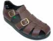
Sandal Booster 10 - 6 E