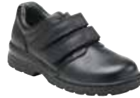
Boy's Double Velcro Locker 8 - 3½ D, E, F, G Verse 10 - 3½ E