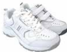
Sneaker - Lace-up Vandal 8 - 6 E