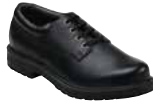
Lace-Up Lesson 8 - 3½ D, E, F, G, H Reward 9 - 3½ E Daytona 4 - 13 C, D, E, F, G 247 4 - 14 D, E, F, G, H Infinity Jnr 9 - 3½ D, E, F Infinity Snr 4-8 D, E, F