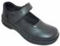
Mary-Janes Indulge Jnr 9 - 3½ D, E, F Indulge Snr 4 - 8 D, E, F Atlanta 10 - 3½ E Rapture 9 - 3½ E Response 9 - 3½ E Elise 9 - 8 E